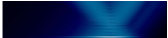
FIG. 1. (Color online) Modulus of the electric field when a leaky slab resonance is excited by an incident gaussian beam coming from the left.

Let us now consider a configuration for which a backward surface plasmon may a priori be excited. We take \epsilon_1 = 12 , \mu_1 = 1 , \epsilon_2 = -5 and \mu_2 = -0.5 and d = 0.6\lambda . No slab resonance can be excited in these conditions because the slab is too thin. The lateral shift for this configuration is represented Fig. 2. A very large negative shift can be seen for \theta \approx 29.94^\circ when \alpha \approx \alpha_p . This shift is even greater than in the case of slab resonances because the plasmon is less leaky and hence it propagates further. Let us stress that the field is evanescent in the LHM ( \sqrt{\epsilon_2 \mu_2} k_0 < \alpha ) and in the air so that this resonance is without any doubt a surface plasmon.